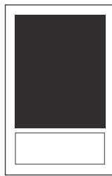
Three Quarter Page 4.5" x 5.125" $1,000