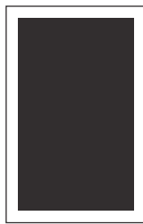
Full Page 4.5" x 7.5" $1,500